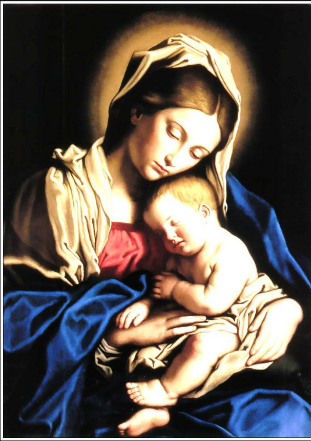
Mary the Holy Mother of God