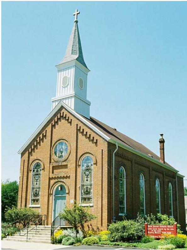
131 Rohde Street, California, Ohio