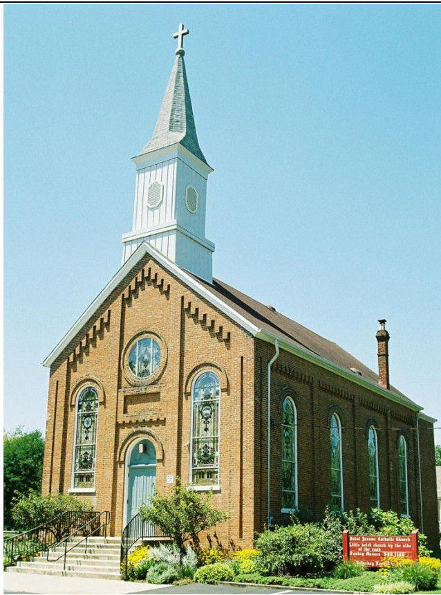
131 Rohde Street